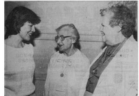
HOSPITALITY HOUSE FOUNDER HONORED