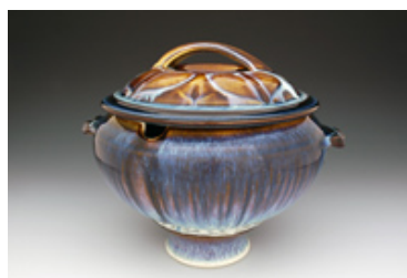
1st Place Professional Division