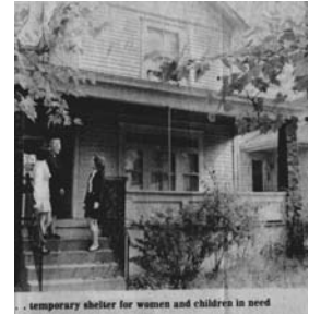
205 Myrtle Street the original HOSPITALITY HOUSE