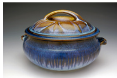
1st Place Gifted Amateur Division

The winners in the respective categories will be awarded these dramatic and appropriate examples of the artistry of Campbell's Pottery